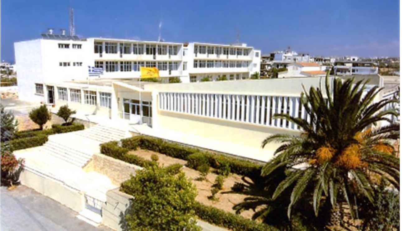
Fig. 1 The Patriarchal University Ecclesiastical Academy of Crete