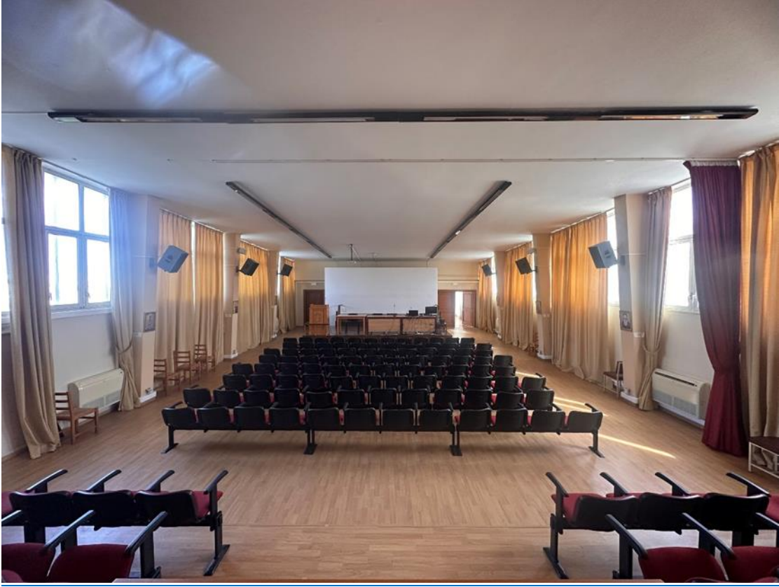
Fig. 5 Auditorium