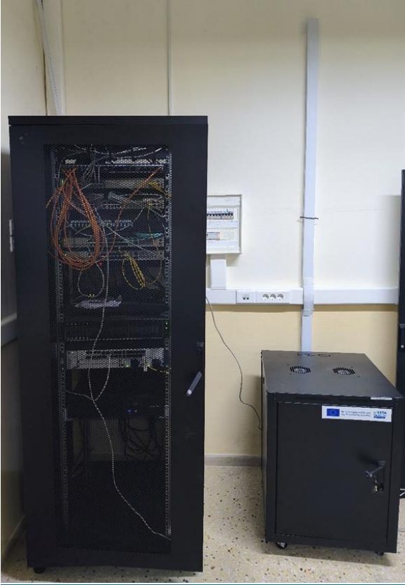
Fig. 8 Computer Lab