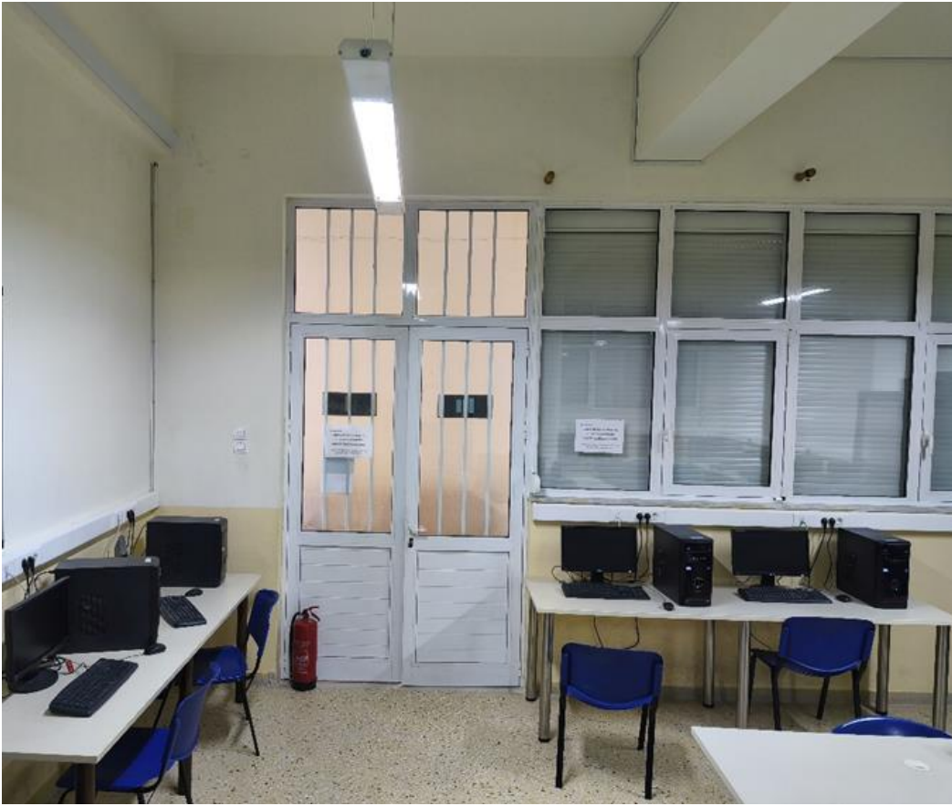
Fig. 10 Computer Lab