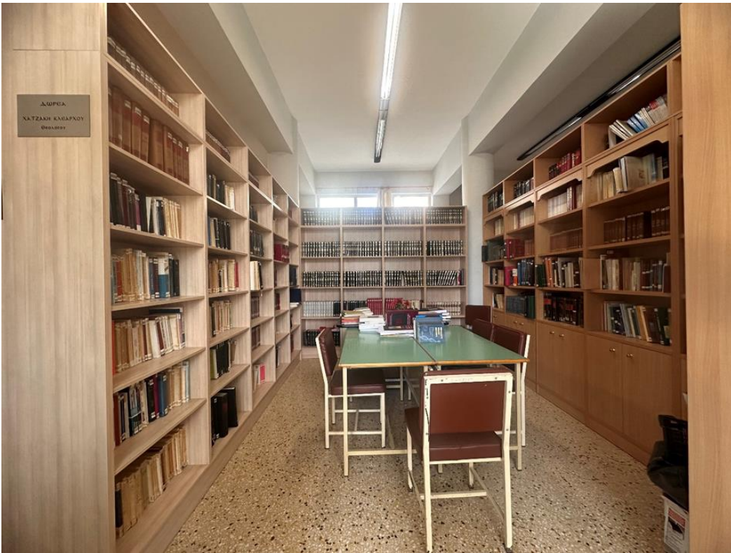
Fig. 11 Library