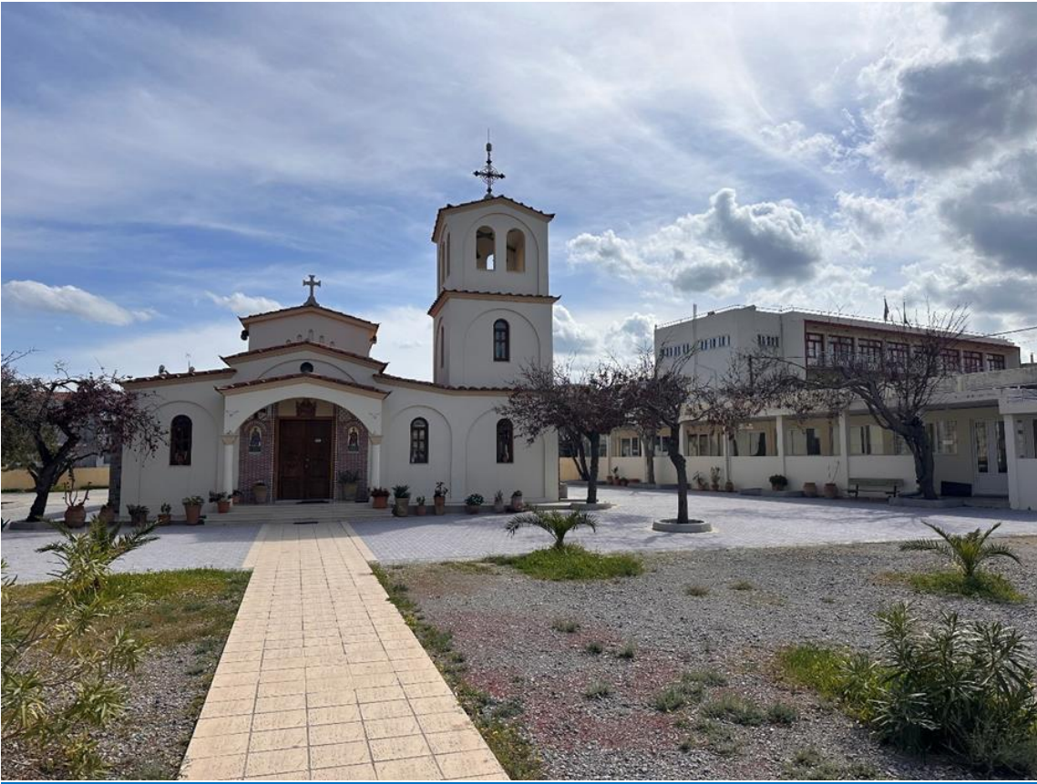
Fig. 2 The church of Agia Skepe and the student residence