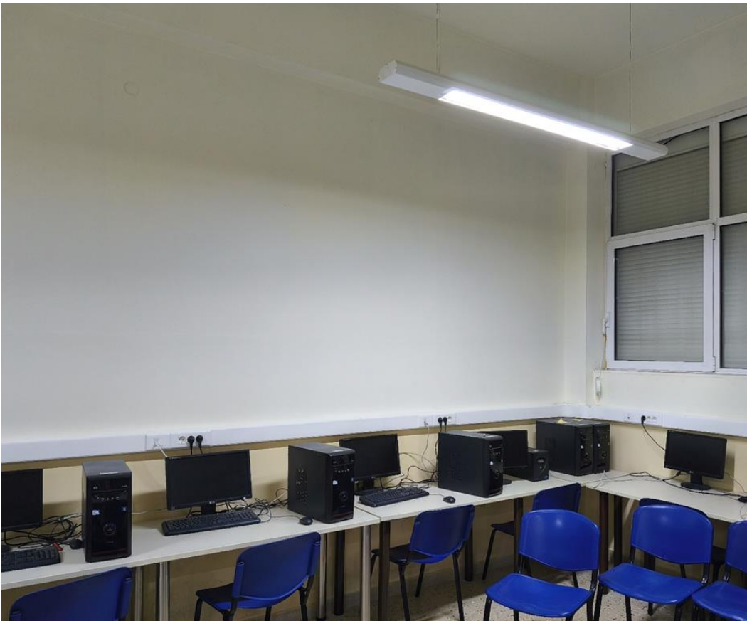
Fig. 9 Computer Lab