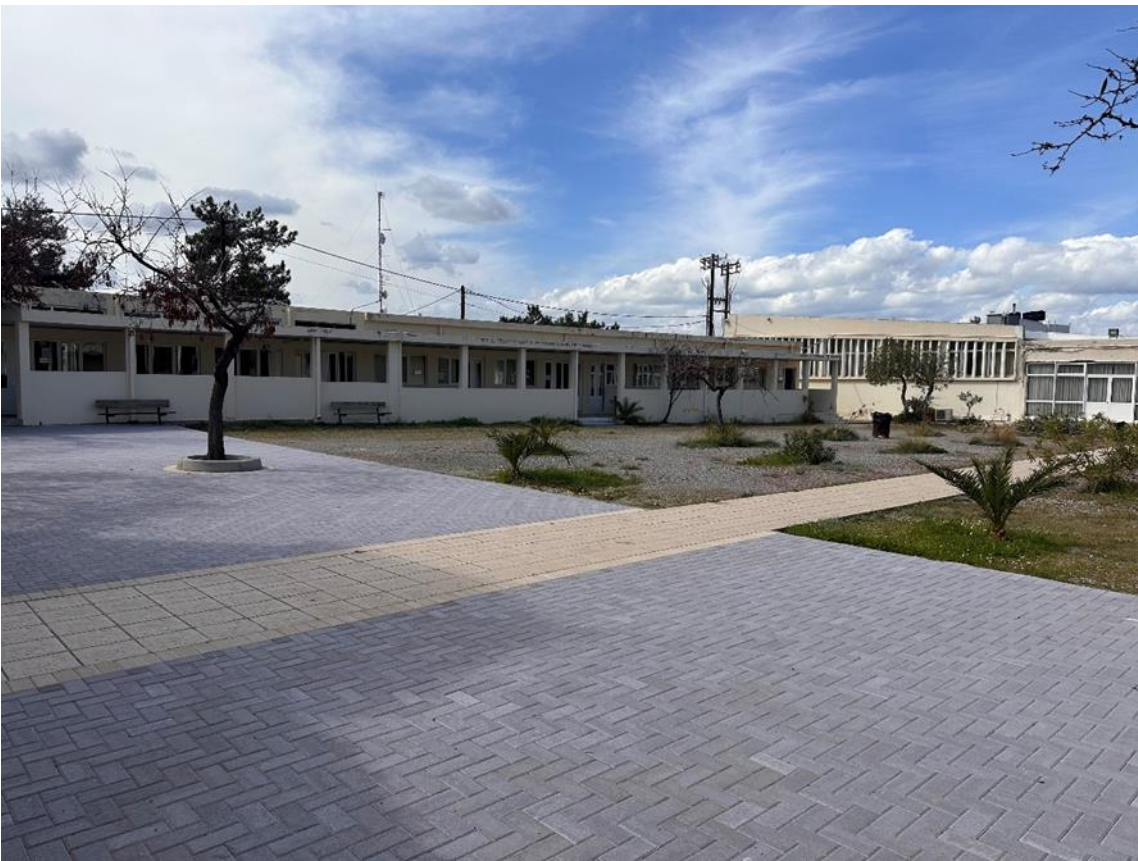
Fig. 3 Classrooms and Auditorium