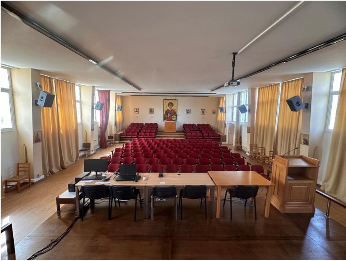
Fig. 4 Auditorium