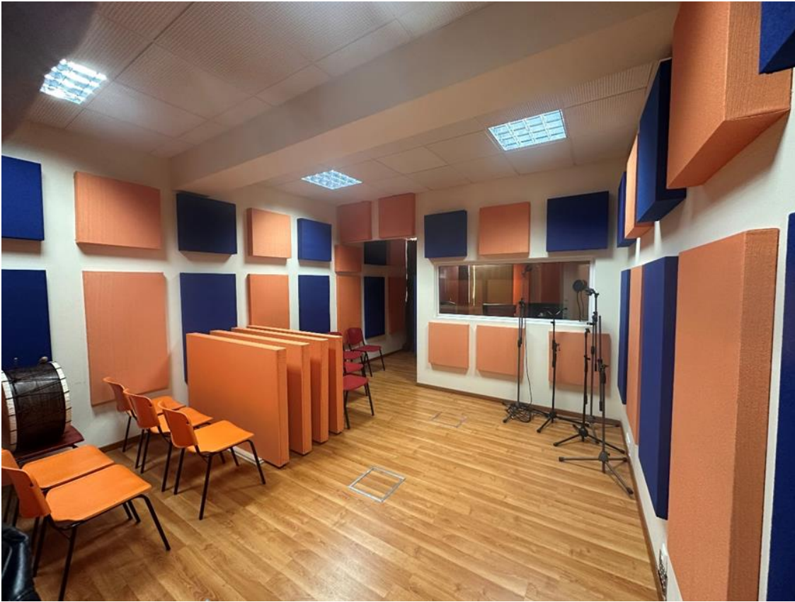
Fig. 6 Recording Studio