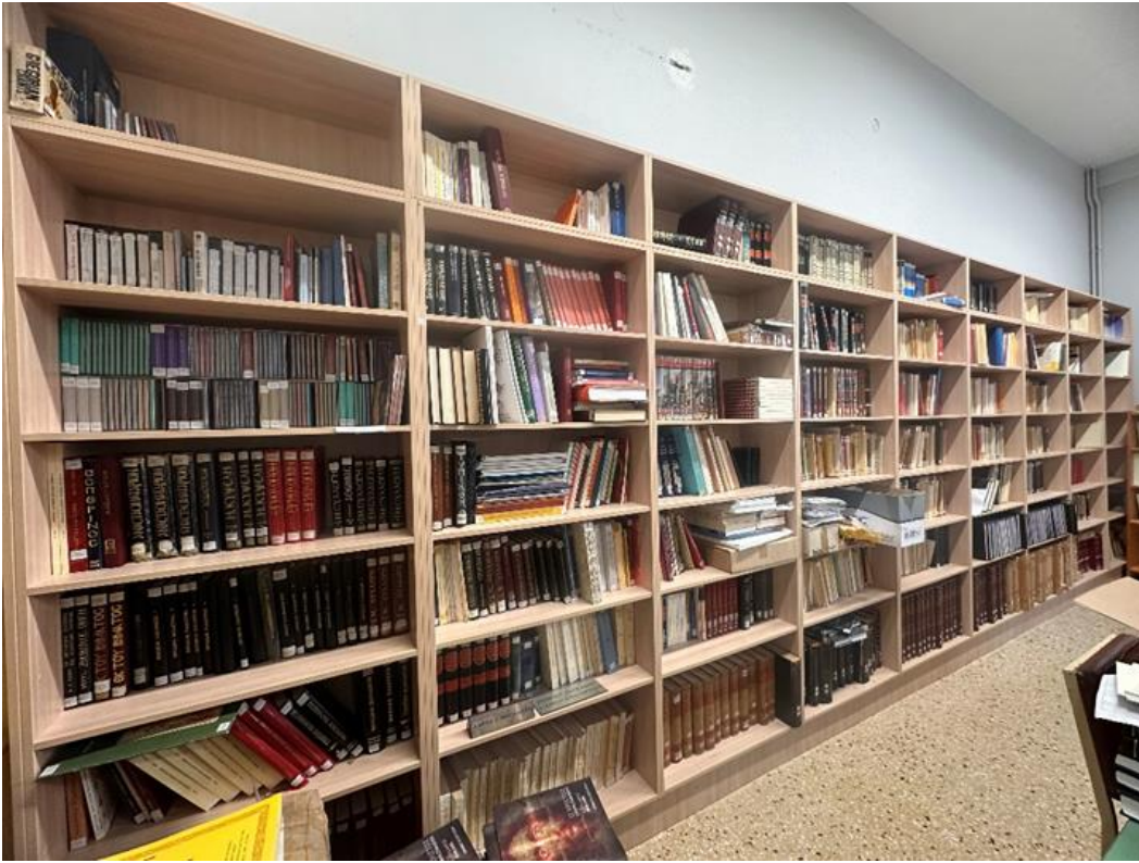
Fig. 12 Library